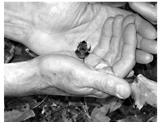
Tiny tree frog ( Hyla Crucifer ) in Gordon's hands