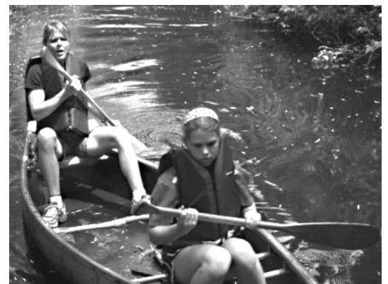
Canoeing on the Sudbury

the river is here and are amazed when they get up close and personal at how truly beautiful it is. Plans are already underway for next June's 5 th annual event.